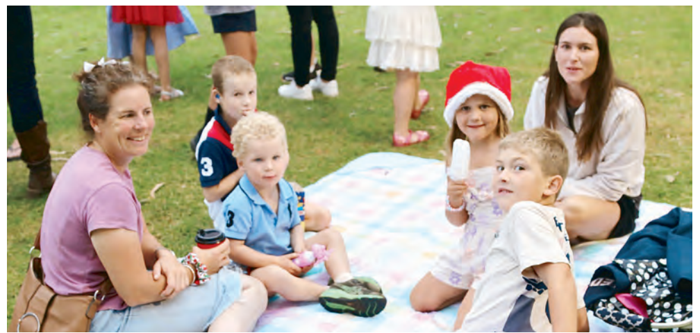
Families enjoy a joyful festive picnic on the grass, soaking up the holiday spirit at the Nyah District Christmas Carnival.