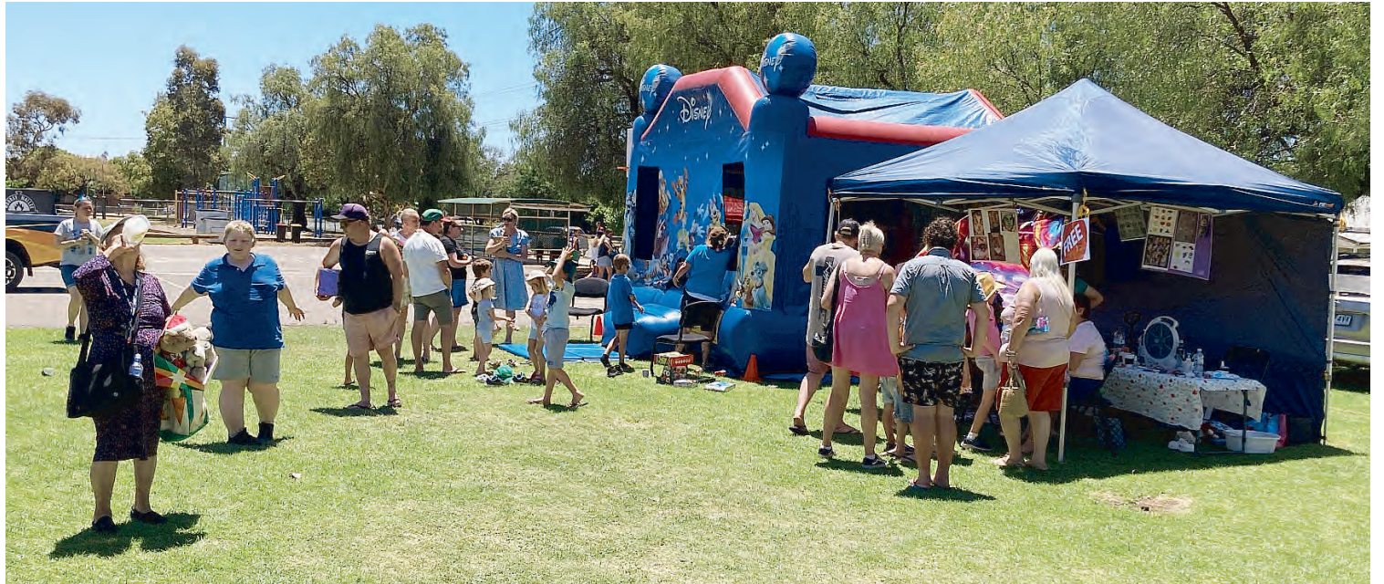
Last year's event was attended by about 400 people despite scorching heat.

"This is a way for everyone to come together and celebrate without worrying about money.