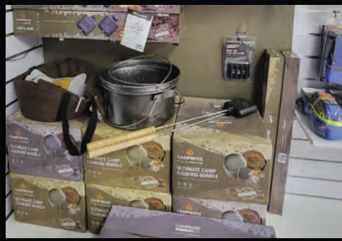
Camp Boss Gear