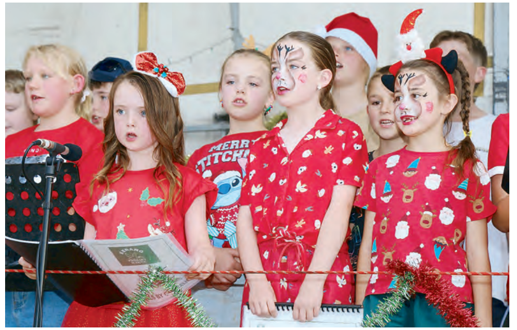
Last year Kerang's carols saw around 400 attendees.