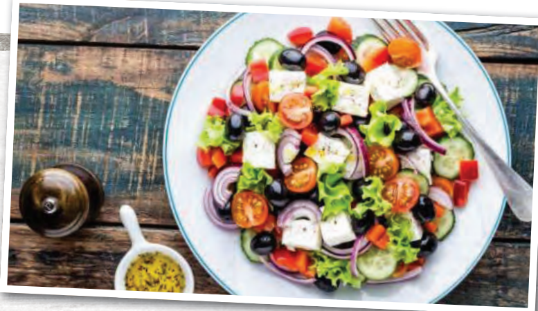
A classic, refreshing Greek salad.

Originating from Italy, the Caprese salad is a celebration of simple, high-quality ingredients. Sliced tomatoes and mozzarella are arranged alternately on a plate, interspersed with fresh basil leaves. Drizzled with extra virgin olive oil and balsamic glaze,