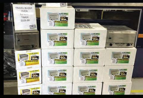
Travel Buddy Ovens