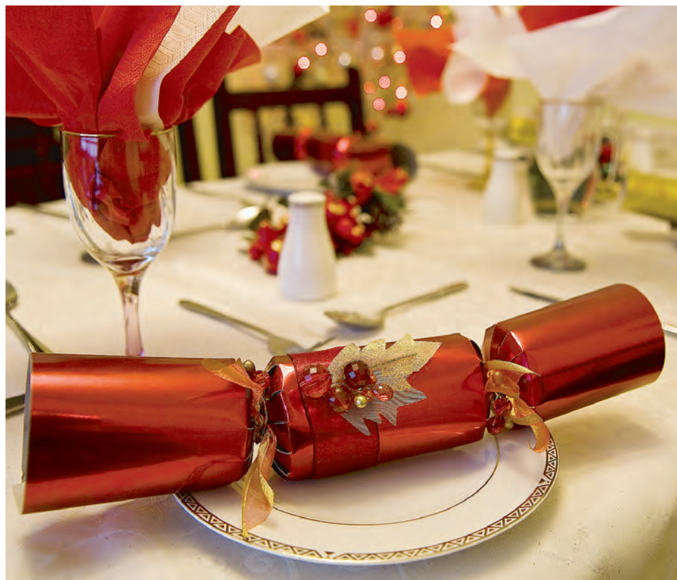
You can customise your crackers to suit your Christmas table settings.