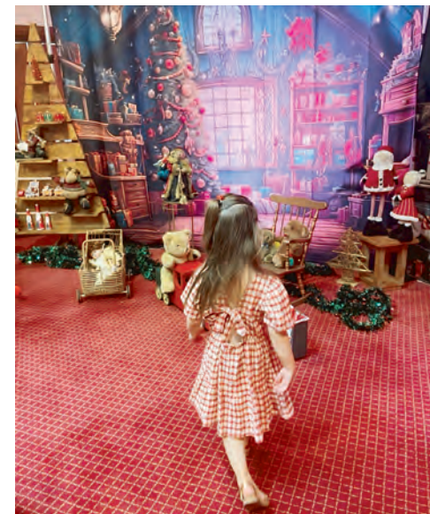
The elves are back at work and the Swan Hill Town Hall is once again being transformed into a sparkling Christmas Wonderland.