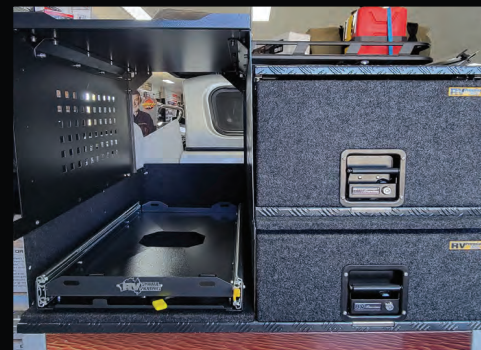
RV Storage Solutions